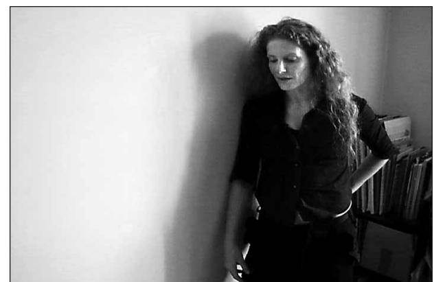
Italian-born actress Domiziana Giordano reflects on the life of Andrei Tarkovsky in this image from Meeting Andrei Tarkovsky. Ms. Giordano played the role of Eugenia in Tarkovsky's celebrated film Nostalghia, which won the FIPRESCI Prize at the 1983 Cannes Film Festival.